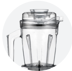
1.4 LITRE CONTAINER